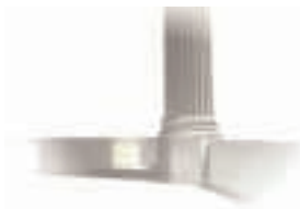
Detail, 3D model