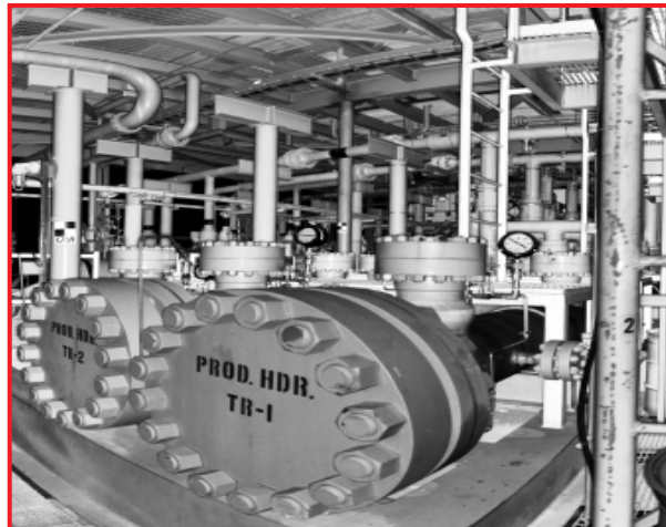
Quantapoint 2D Laser Scan (Not a Picture) Each Point is a Measurement